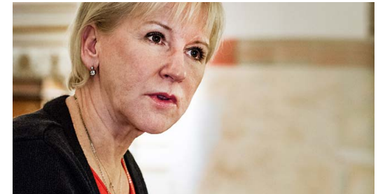
Sveriges utrikesminister Margot Wallström.